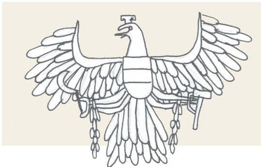
The eagle is the heraldic animal of Austria

are getting involved in organizations like the U.N. or even smaller ones in local areas like debating clubs, groups, etc. Being informed about the current political situations also plays an important role.